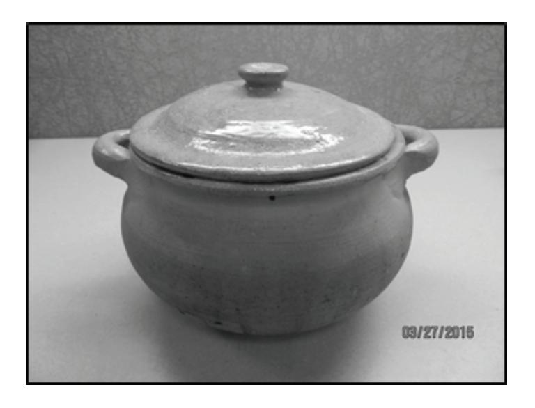
Figure 1. Lead-glazed bean pot used by a family in Minneapolis.