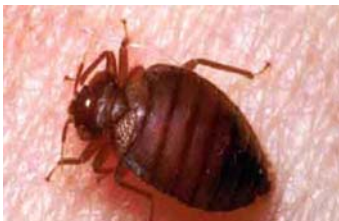
University of Minnesota Extension

Bed bugs are small insects that feed on human blood. They are flat, oval, reddish-brown and wingless. The adult is about 1/4